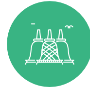
Indonesia Design & Support