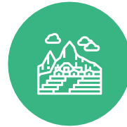
Peru Design & Support